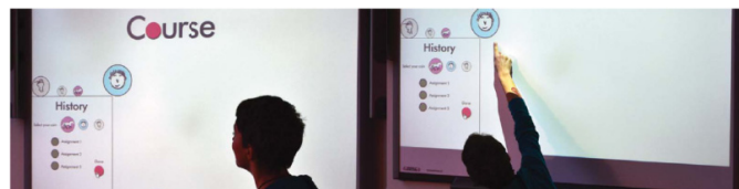
Fig. 3. Management of ADHD in classrooms

In another project, we developed an interactive tool that helps children with Attention Deficit Hyperactivity Disorder (ADHD) to make fruitful use of breaks. Children with ADHD have concentration problems, but also problems with planning (so timing) of executive tasks. The interaction tool uses power breaks in a classroom to reflect and to plan the executive task in a playful way (Fig. 3). In this design, both time instants and intervals are important for the children to make proper planning.