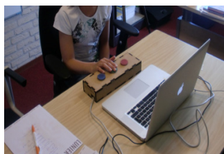
Fig. 1. Time interaction tool

The designed time interaction tool consists of a three-button input device and a software program (Fig. 1). The user has to memorize tone patterns of no more than three sounds that are supported by colored blocks on a screen. After a few seconds of pause, the sound has to be reproduced by pushing the buttons. The assumption is that children with dyslexia perform worse on the task, and show a slower learning curve for the accuracy of the task. An instant based time model is used to implement the program, but the intervals are derived from the time instants for the children to estimate the time span of the sound.